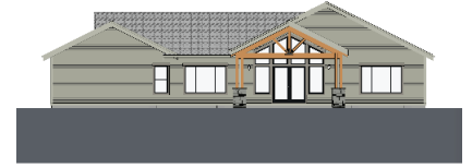
REAR ELEVATION Shown in Timber