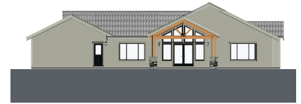
REAR ELEVATION Shown in Timber